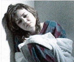
2013 MENTAL HEALTH MOTION...