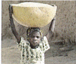
EXPLOITATION THREATENS AFRICAN...