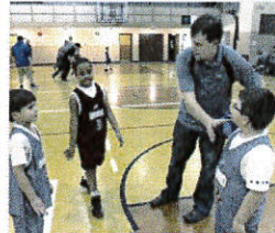
DEAF CHURCH PLANTER WORKS...