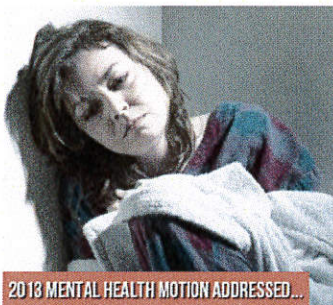
2013 MENTAL HEALTH MOTION ADDRESSED...