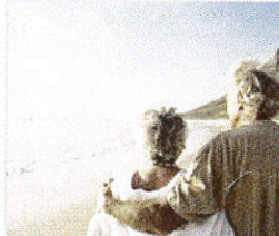
FIGHT FOR WHAT IS GOOD AND...